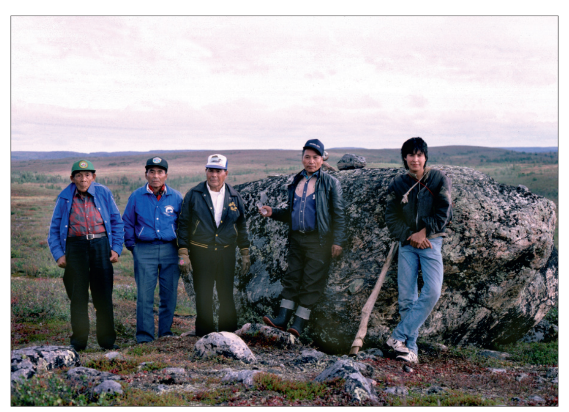
Photo 2. Tłįcho elders and youth at Edzo's Rock, Gots'okati (Mesa Lake), August 1988.

occurred. That traditional view needs to be shared, so that the scientific community can take those things into consideration. But that's like pulling teeth because the laws don't necessarily recognize the traditional view of rights and titles.