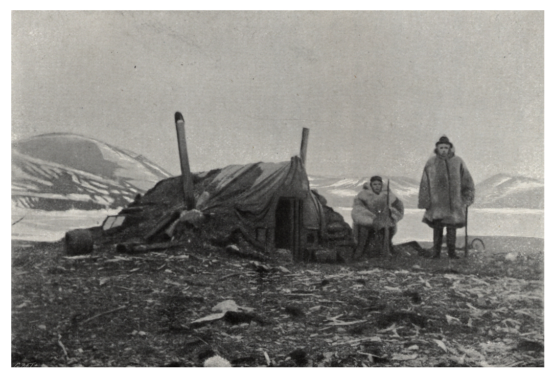
Fig. 2: "The Survivors and Their Hut." Illustration in The First Crossing of Spitsbergen.

Even if Conway was more an adventurous tourist than an explorer, and his lightness of tone suggests the former, he underscores the extreme severity of the Arctic climate and natural conditions in and around Svalbard. These are encountered early in The First Crossing of Spitsbergen when on their approach to Advent Bay drift ice threatens to trap and destroy their ship. Soon after, they take on board from a small boat two men with "a horrible tale to tell of privation, sickness, and death" (FC 55). They are the survivors of a party of four Norwegian reindeer hunters who had been and forced to winter on Svalbard, first in their boat, which was later crushed by the ice, then in a makeshift hut. As a reminder to his readers of the potential perils of travel to the High Arctic, Conway recapitulates their story in the form of a long firstperson narrative based (as his 1896 notebook proves) on detailed notes taken at the time. He also describes the wreck of their sloop, their hut and the two barrels covered with a sail that contain the body of their dead skipper, the frozen ground having made it impossible to bury him (fig. 2). On the last evening of their overland journey Conway revisits the site to look at "the winterer's grave and the ruins of his hut" and is struck by the "settled melancholy [that] pervaded the silent scene" (FC 316). The plight of the survivors confirm Dufferin's claim that Svalbard winters are "unendurable" (Dufferin [1857] 1879, 196).