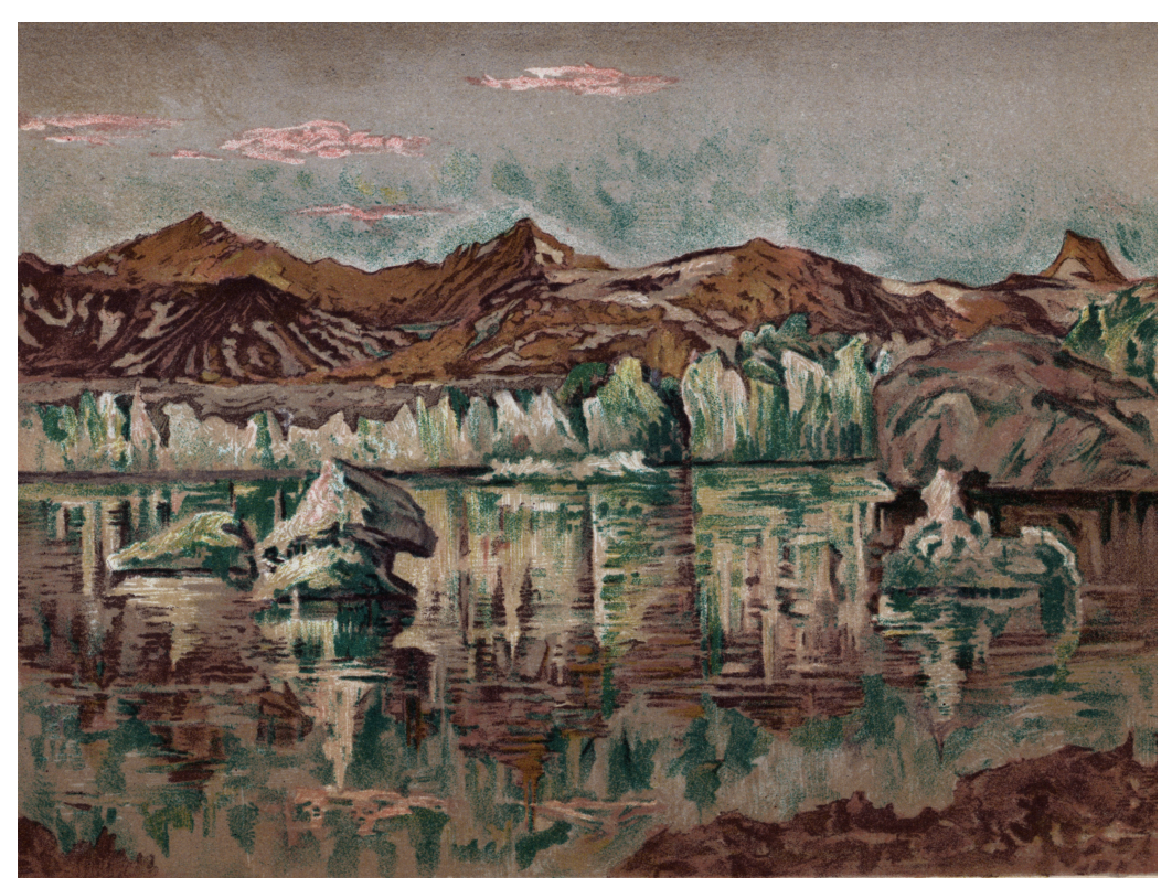
Fig. 3: "Glacier Front in Ekman Bay." Illustration in The First Crossing of Spitsbergen.

(FC 285) – to cite only a few examples. Even the snowfields are colourful. "What struck us most was the colours," he comments about the view from the middle of the three mountains known as the Crowns. "The desert of snow was bluish or purplishgrey; only the sea mist [...] was pure white" (SS 120–1). Particularly in his account of the second expedition, during which good weather prevailed, he consistently counters "the rather colourless stereotype of the Arctic" that, as Robert David has argued, persisted throughout the nineteenth century in spite of the many passages in travel narratives referring to the colourful northern landscapes, icescapes and sky (David 2000: 39). The emphasis on colours and diversity, displayed in The First Crossing of Spitsbergen in eight inserted colour reproductions of landscape paintings by Conway's cousin (fig. 3), gives his descriptions of Spitsbergen a picturesque quality. So do references to "fine effects to reward an observant eye" (FC 157) and "infinite varieties of effect" (SS 10). This aesthetic approach not only challenged the popular perception of a desolate Arctic, but also Dufferin's emphasis on stillness and death.