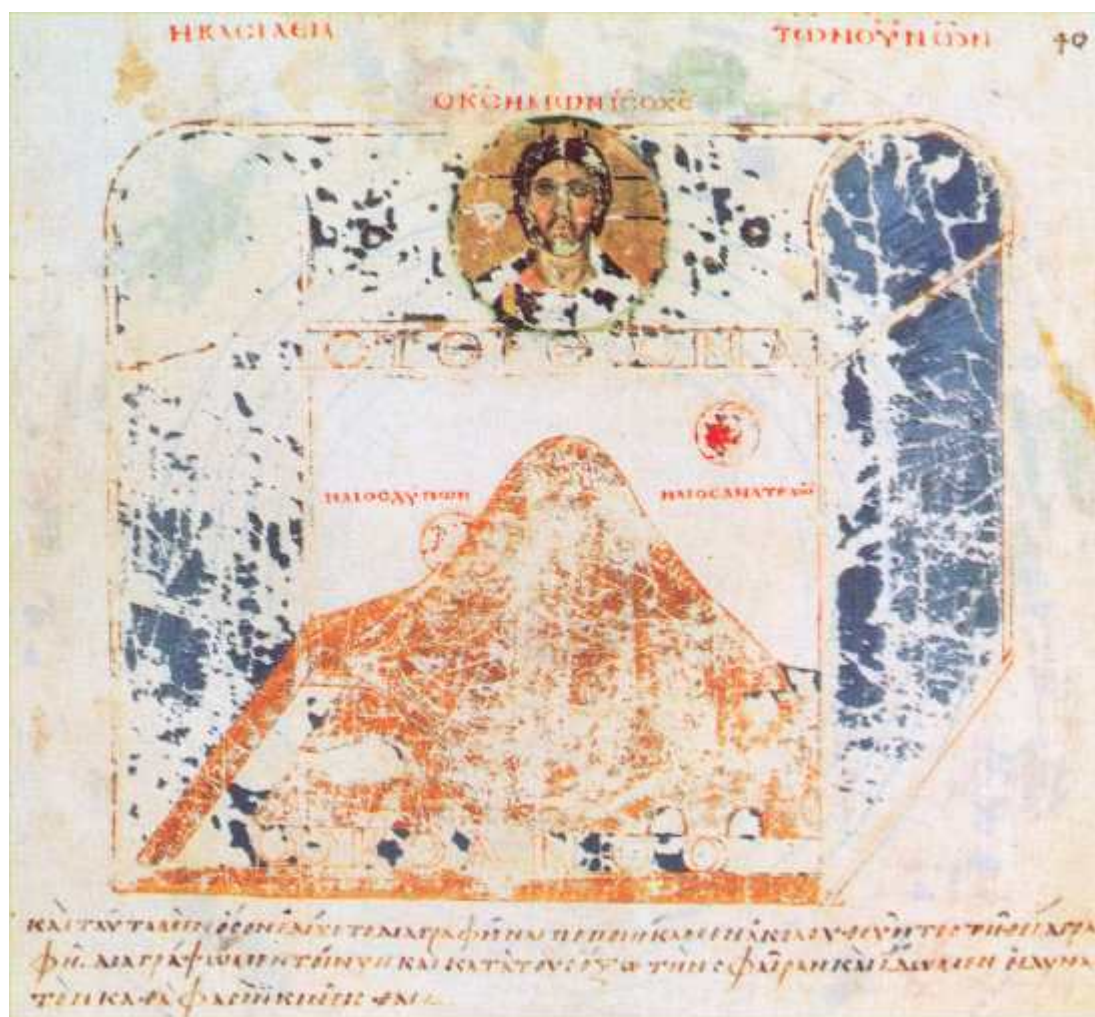
Fig. 4: Cosmas Indicopleustes, Topographia Christiana . Sixth-century manuscript.