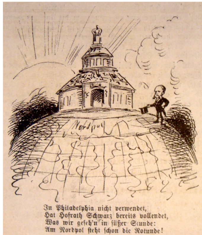
Fig. 6: Theodor Z. (Zajaczkowski), “Franz Josef’s Land.” Detail. From Humoristische Blätter 27 September 1874.

At the beginning of the twentieth century it became common to seal the attainment – “the conquering” – of the pole with a national flag driven into the ice, as had already been the case on mountaintops. Photographs of the American expedition of Peary (1909) as well as those of the Soviet expedition of Papanin (1937) show how important the form or, perhaps better stated, the illusion of the mountain summit was (fig. 7). What remains unclear is whether the visualization of the pole as a summit served to increase the authenticity effect or the lofty significance of the event. Particularly significant, however, is that hoisting the national flag manifested the international competition for a place of global symbolic meaning. The image of polar conquest as the mastering of the world’s summit suggested a vision of capturing world domination.