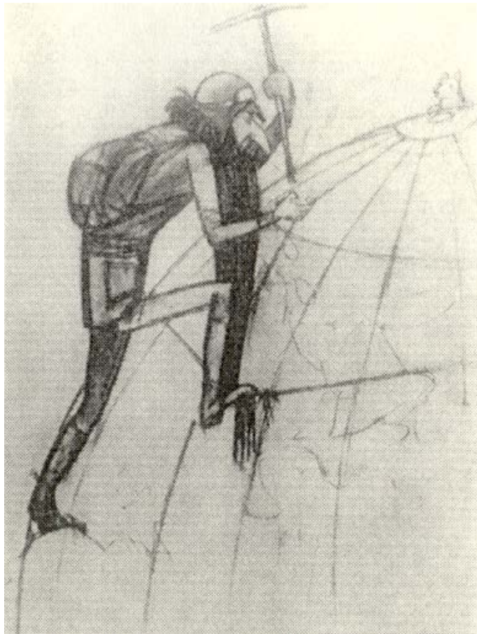
Fig. 1: Fedor Reshetnikov, sketch of Otto Yulevich Schmidt. In Fedor Reshetnikov, Otto Yulevich Schmidt: Zhizn' i dejatel'nost' (Moskva, 1959).

To a certain degree, the mythological legacy of the North Pole semantics even found expression on the Soviet flag. In 1923, an image of the globe replaced the imperial two-headed eagle, which had still been visible in 1917. In the context of the modern era, the globe as a new emblem offered 1930s Soviet culture the opportunity to envision the Soviet Union as the conqueror of the cosmos and as perfecter/completer of world history. In this context, the world-mountain and the North Pole no longer symbolized the border between the earthly world and transcendence, but rather the border between the present, current empire of man and the future. This mythological legacy of the world-mountain manifests itself especially clearly and in no way disparagingly in a caricature from 1938 that depicts the leader of the most important Arctic expedition of the 1930s, Otto Yulyevich Schmidt, head of the Soviet Directorate of the Northern Sea Route “Glavsevmorput’,” climbing the globe like a mountain, striving towards the North Pole as towards its peak (fig. 1).