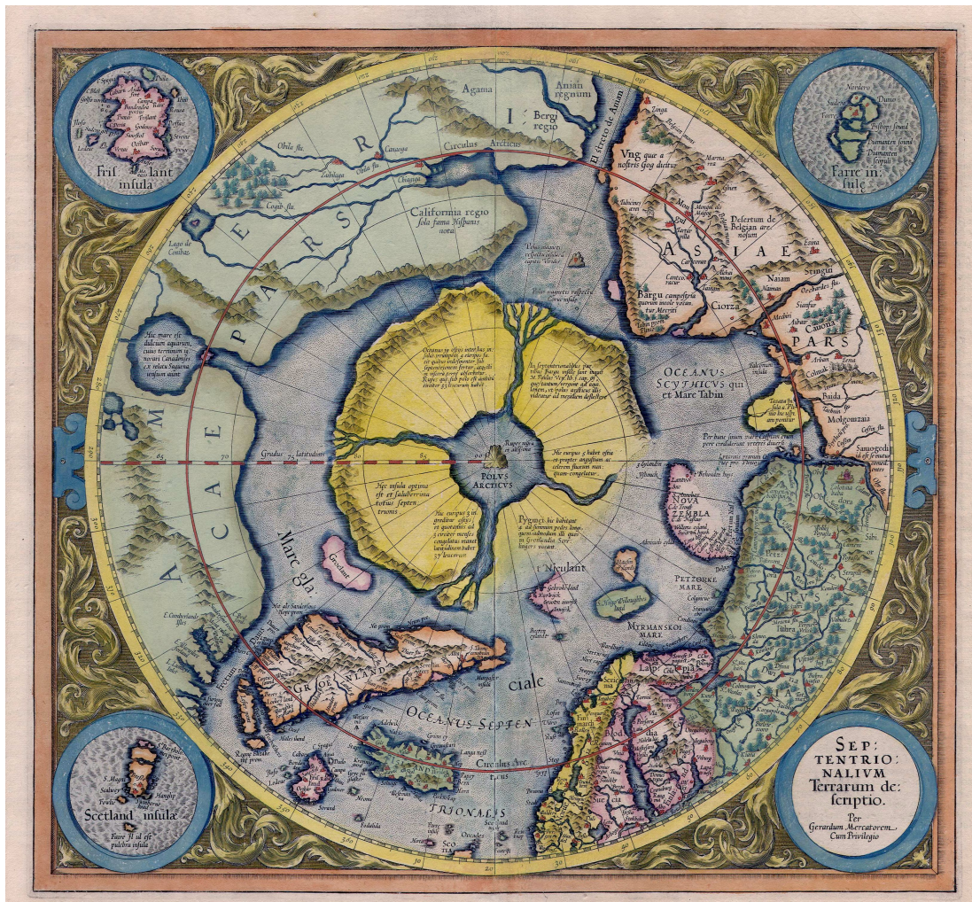
Fig. 5: Gerardus Mercator, Septentrionalium terrarium description. A map of the North Pole, 1623.