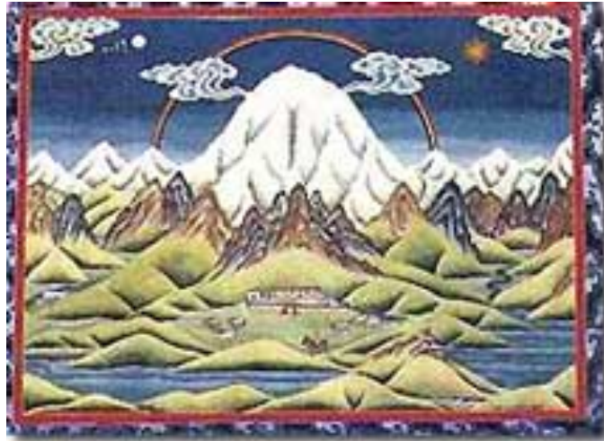
Fig. 2: Ancient Thangka depicting Mt. Kailash/Meru.