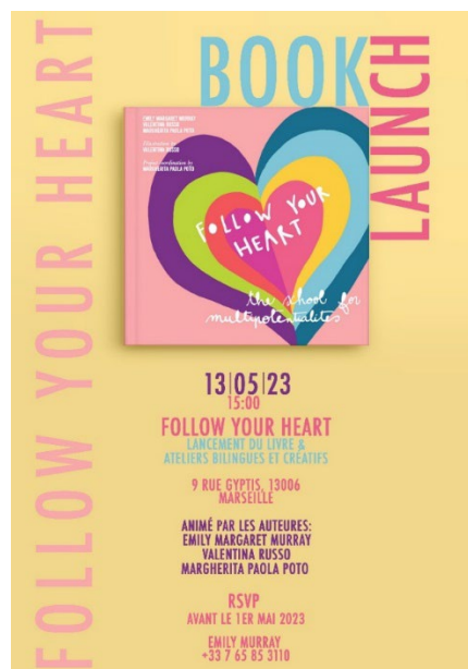
Figure 1. The poster of the event created by Valentina Russo