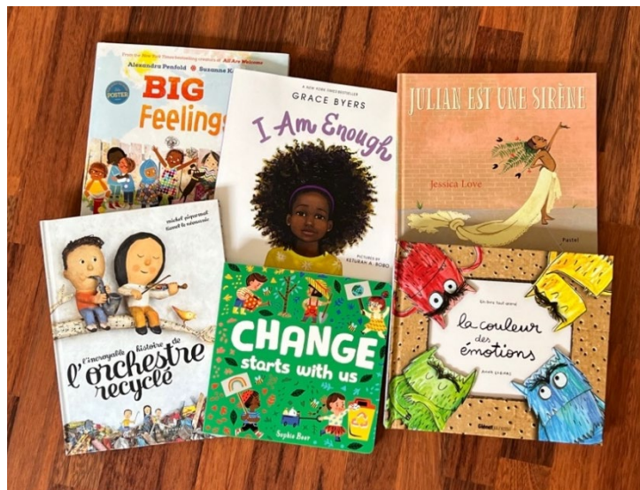
Figure 6. French and English books displayed at the book launch.

Alongside the creative activities, there was a separate table of print resources purchased from local bookstores in both Canada and France. These print resources were a variety of multilingual children's books on emotions and the environment, some of which are listed in the Suggested Readings section in the back of Follow Your Heart: the school for multipotentialites . These resources were displayed for participants to look through and learn from at their leisure and to show the range of children's books accessible to the public. These resources were also presented to spark ideas and conversation about integrating emotional and environmental education in children's lives from an early age. At future book launches and other events, these resources can also be used as learning opportunities for both children and adults.