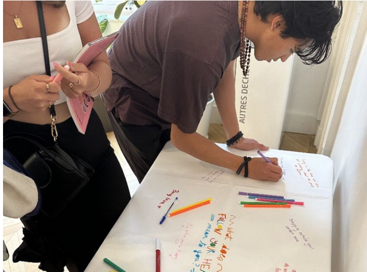
Figure 6. Participant answering the question.