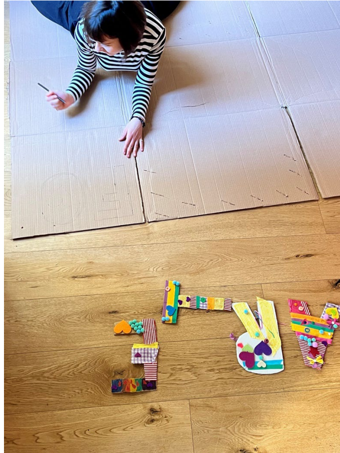
Figure 3 Valentina Russo preparing the materials for the Arts and Crafts workshop