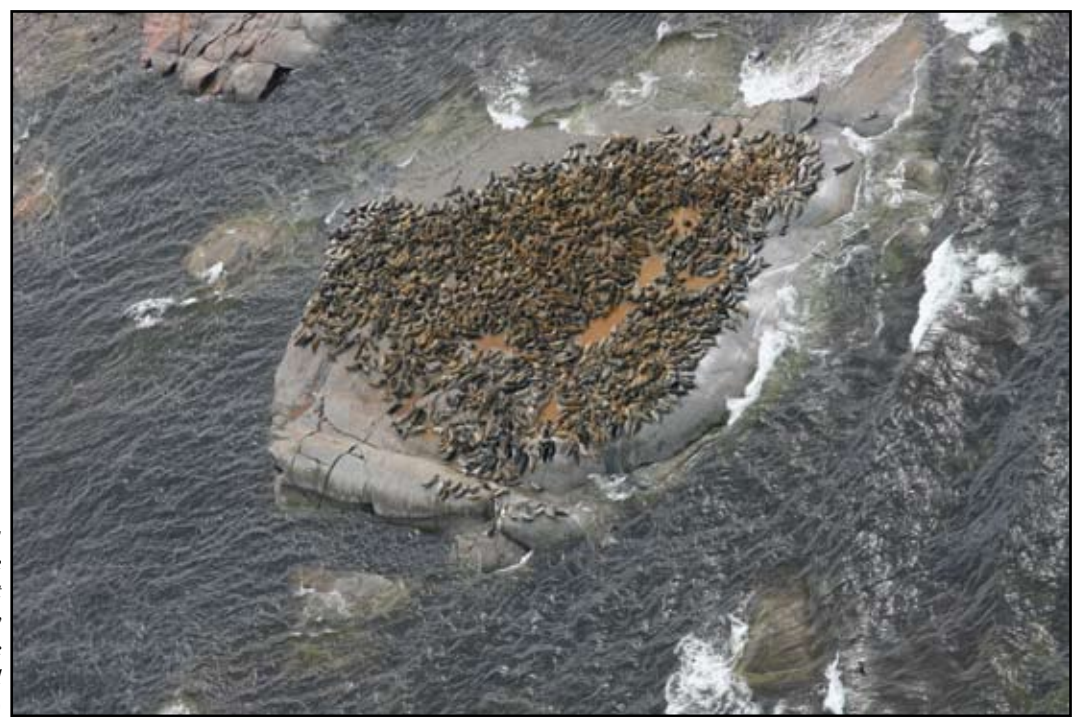
Fig. 1. Grey seals haul out in large numbers to moult in May and early June in the Baltic Sea.

visited during the final year of the study. Photoid uses re-sightings of animals with distinctive markings as a method for studying population size and movement patterns as well as other population parameters. The technique is non-invasive and relatively inexpensive, compared to traditional tagging methods, and has been used successfully on several whale, dolphin and seal species ( e.g. Biggs 1982, Clapham and Mayo 1990, Würsig and Würsig 1997). In this paper we use the results of the photo-id survey to estimate the size of the Baltic grey seal population.