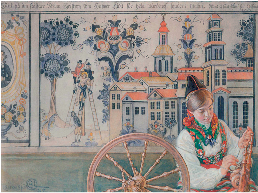
Image 8: In 1917, Carl Larsson completed The Spinner on a visit to Bingsjö. The painting was immediately sold to a buyer abroad and was not rediscovered until 2007. In the background we see Carl Larsson's copy of Winter Carl's Descent from the Cross showing the lower left corner before it was damaged.

As can be seen, the painting has been damaged. This damage must have occurred sometime after 1917. For decades it was impossible to know what the artist might have painted in the lower left corner. In 2007, however, a previously unknown watercolour by Carl Larsson surfaced at an auction sale. It shows a woman sitting at a spinning-wheel against the background of Winter Carl's Descent from the Cross (Image 8). It is one in a series of watercolours that Carl Larsson completed in 1917 during a visit to Bingsjö. Soon after painting it, he sold the work to a buyer from Austria, where it remained until 2007. 29 Carl Larsson's painting reveals that originally one additional person supported the central ladder on which Christ is being carried down. With this addition the composition is much firmer than in the damaged version. The Carl Larsson painting also indicates that Winter Carl included two female figures, presumably the two Marys.